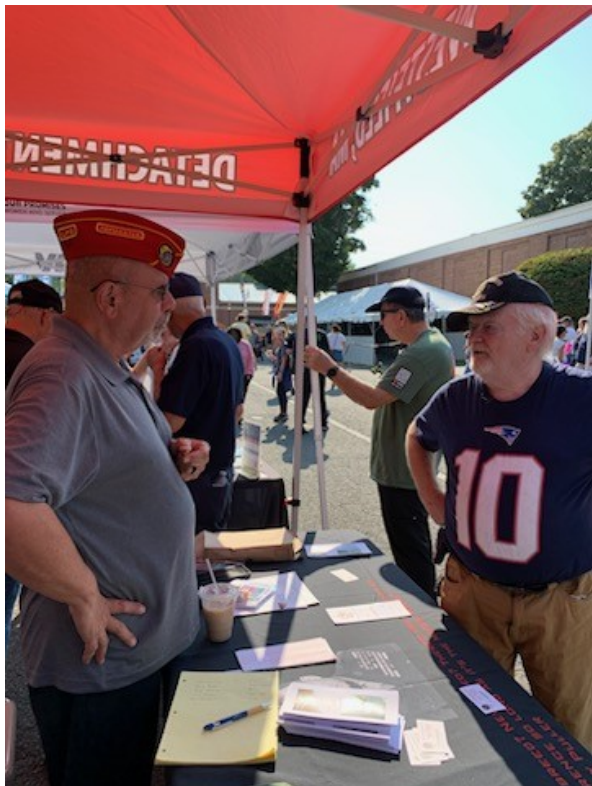
Talking to service members and veterans at the Big E