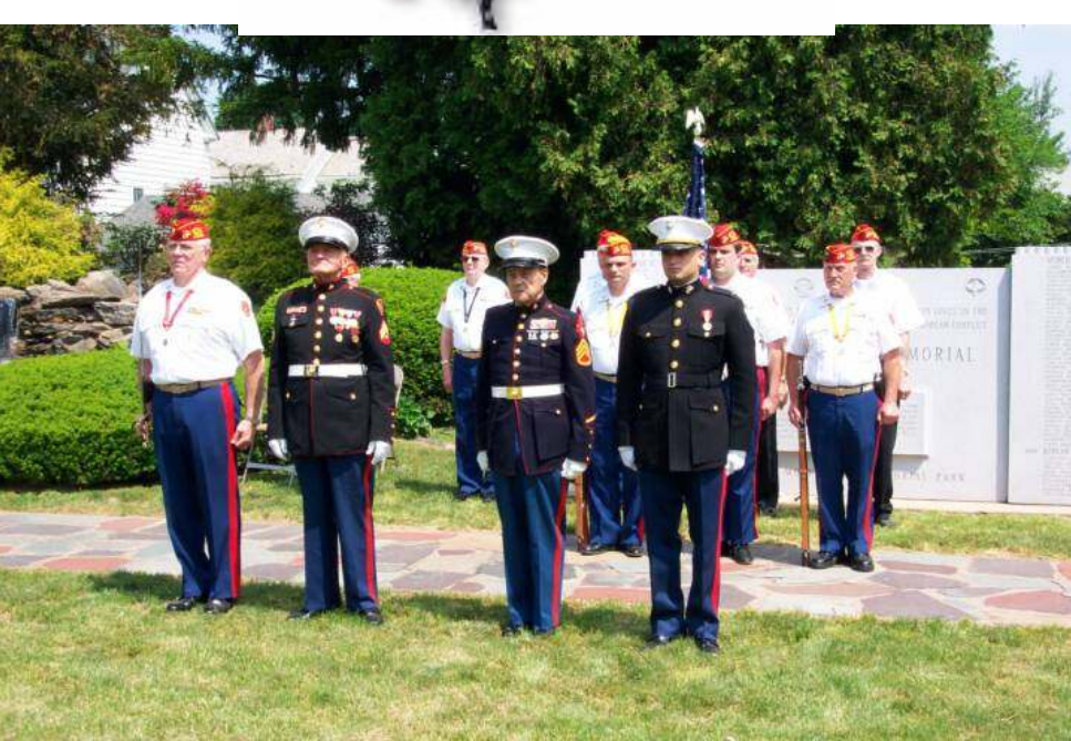
Members of the Marine Corps League during the Ceremony at Parker Park after the Marching of the Memorial Day Parade 2007.

Next Meeting is June 9, 2008. Social Hour at 1800. Meeting starts at 1900. Please attend your Meeting